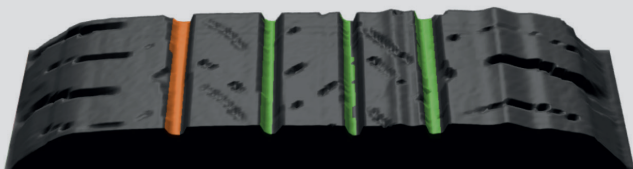
TreadReader™ 3D tire scan

Rear Left NSR 80% worn mm 2.9 3.4 3.7 3.8